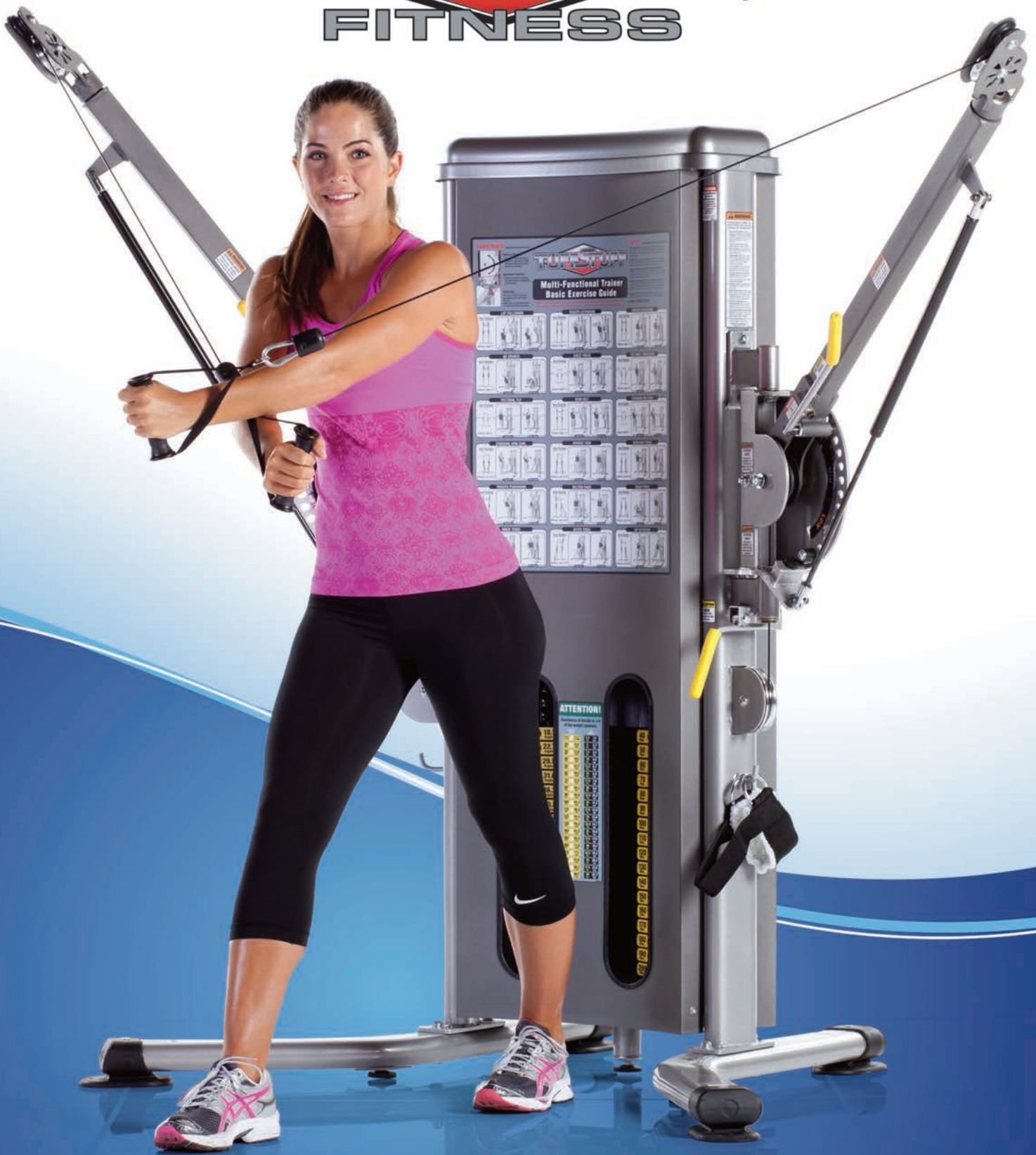
MFT-2700 Dual-Stack Functional Trainer